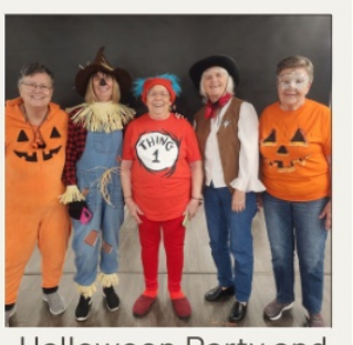
Halloween Party and Family Feud