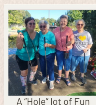
Mini Golf Tournament