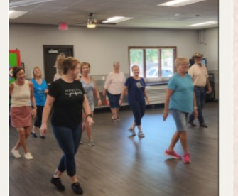
Line Dance Lessons Line Dance Parties