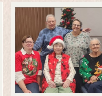
Quilt Ladies Christmas

Try a new restaurant Connect with an old friend