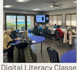
Digital Literacy Classes with YWCA