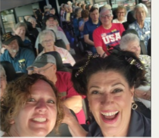
Golden Tours Trips 5 trips = over 200 people