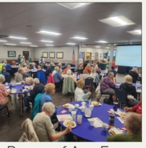
Power of Age Expo 12 events = 642 people