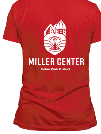
Enjoy Your Age! on the front and Miller Center logo on the back