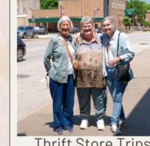
Thrift Store Trips 7 trips = 79 shoppers